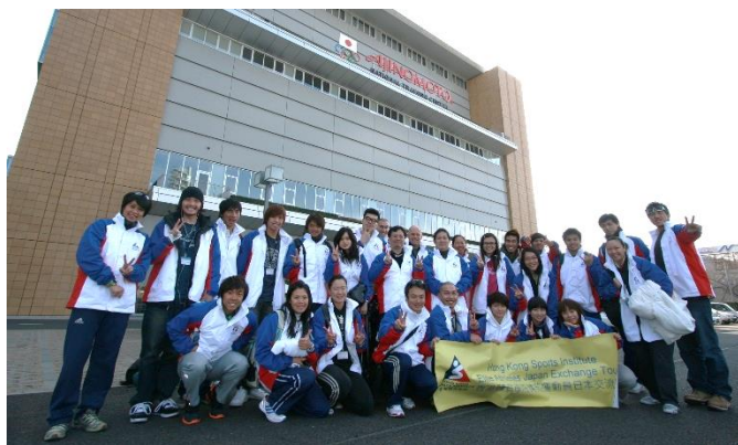
日本國立運動科學學院 Japan Institute of Sports Sciences