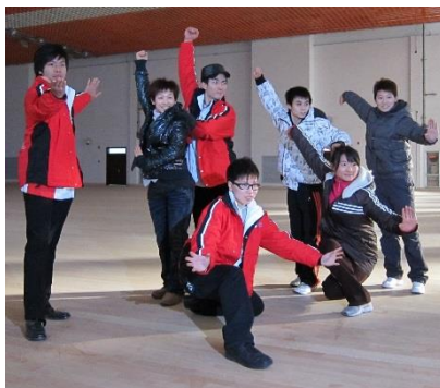
與國家武術隊交流 Exchange with the national Wushu team